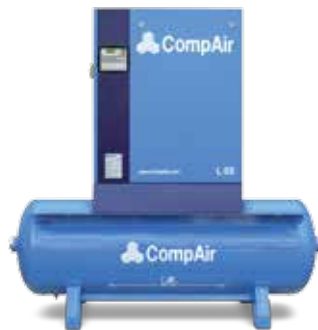
Receiver mounted compressor