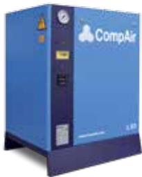
Compressor base mounted