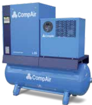
Complete airstation including compressor, dryer and receiver